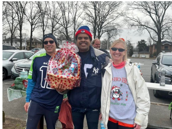
2nd Place Team: Groundhogs