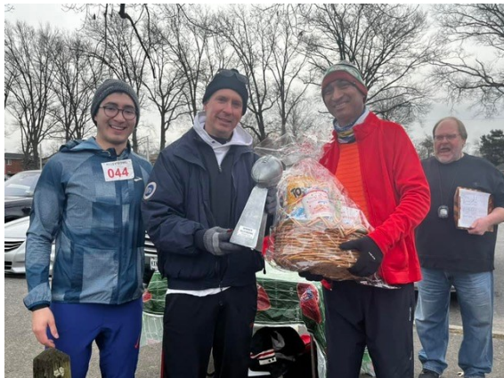
1st Place Team: Terminators