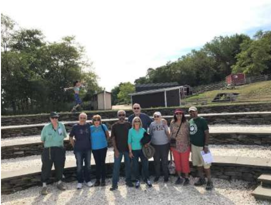
Pictured at NJL Park (left to right):

Note to all Runners and Walkers – these great events are open to all Striders, so please join us on our next excursion. Keep an eye on the emailed Constant Contact for upcoming walks.